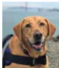
Posey, you were a good boy.