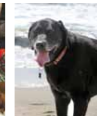
Shadow, you were a good boy.