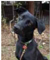
Esther, you were a good girl.