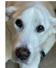
Hank, you were a good boy.