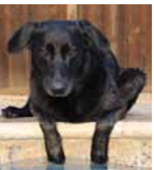
Jetta, you were a good