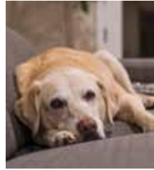
Marley, you were a good girl.