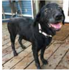
Duchess, you were a good girl.