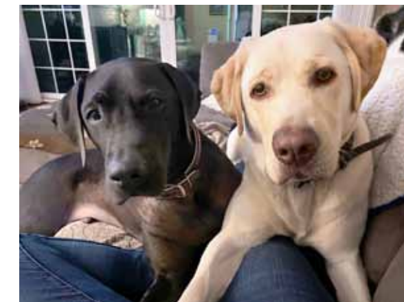
Blaze & new sister Lexi

To catch you up, Blaze is such a wonderful addition to our household. Definitely an old soul in a young body, very intelligent, likes his routines and order in the house, loves snuggling but also going out and meeting new people and dogs. His coat has grown in a decent amount, although the vet doesn't know if it will ever be a true full lab coat. That's ok by us and by him – he loves wearing “clothing” and will ask for his jackets and prance around all excited once he's wearing them, like he's showing off.