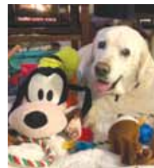
Rubicon, you were a good boy.