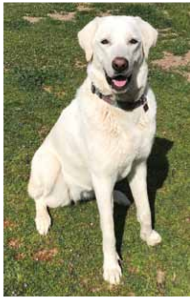
Wait, that ain't a Lab!

In December 2020, a Lab Rescue volunteer evaluated gorgeous 18-month-old 125-lb female "Luca" at a local shelter. She had been surrendered by her owner who reported she was a Lab/Anatolian shepherd mix. That is one big Lab mix. But we've found homes for Lab/Anatolian shepherd mix pups before, so we brought her into our program. Well, her size and power