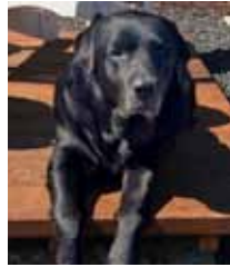
Bear, you were a good boy.