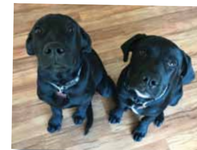
Bingo & Django

late May by an owner who believed she was pregnant. One of the puppies did pass away early on but eleven pups are doing great.