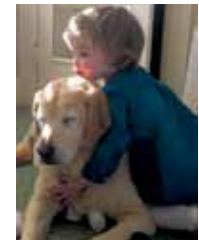
Admiral, you were a good girl.