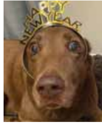
Daisy, you were a good girl.