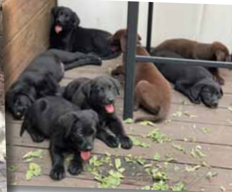
Modesto puppy party