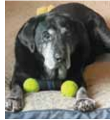
Buddy, you were a good boy.