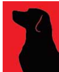
Mollie, you were a good girl.