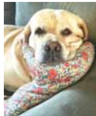
Kent, you were a good boy.