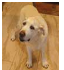
Harvey, you were a good boy.