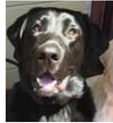
Dukke, you were a good boy.