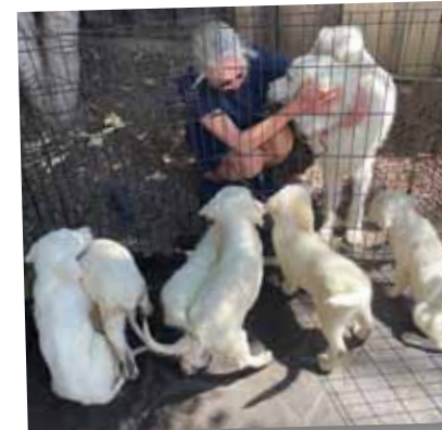
Poppy & puppies