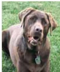
Kea, you were a good girl.